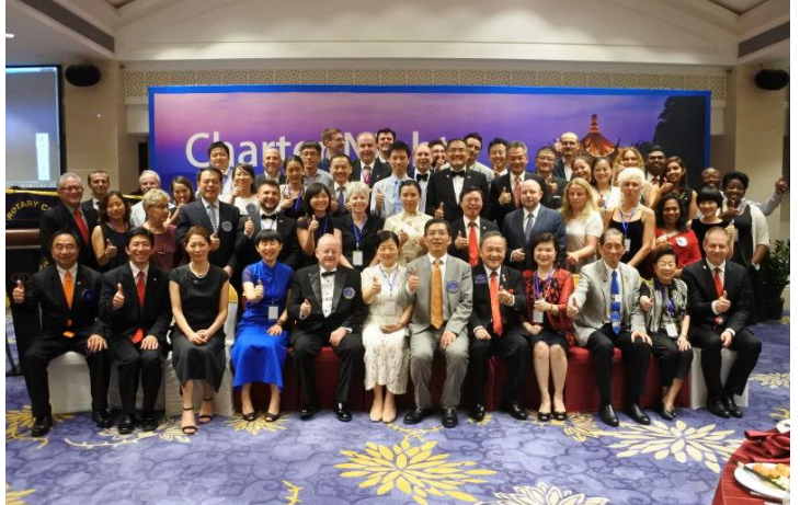
Charter Night Hangzhou